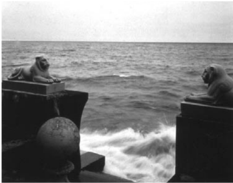
Gwinn, Cleveland, Ohio. Designed by Charles Platt, Warren Manning, and Ellen Shipman.