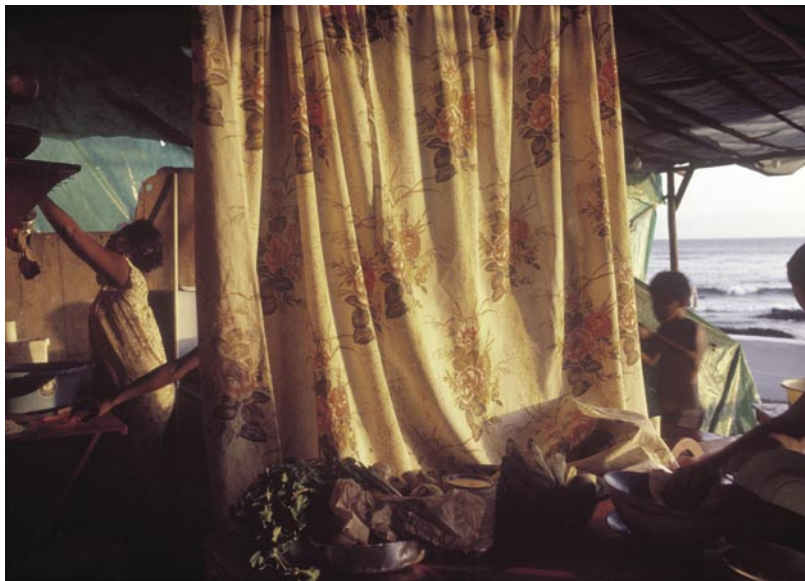
Yellow Curtain , 1984, cibachrome, 24" x 35"

The Haggerty Museum of Art presents "Miguel Rio Branco: Beauty, The Beast," featuring 72 photographs drawn from over 30 years of work. Originally from Spain, Branco now lives and works in Rio de Janeiro, Brazil. He is renowned for his use of color and the richness and complexity of his images of contemporary Latin America. The show remains on view through June 20. The Haggerty Museum is located at Marquette University in Milwaukee, Wisconsin. Call (414) 288-1669 or visit www.marquette.edu/haggerty/ for details.