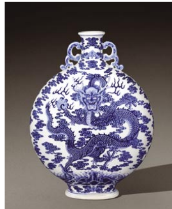
Blue and white Moon flask.