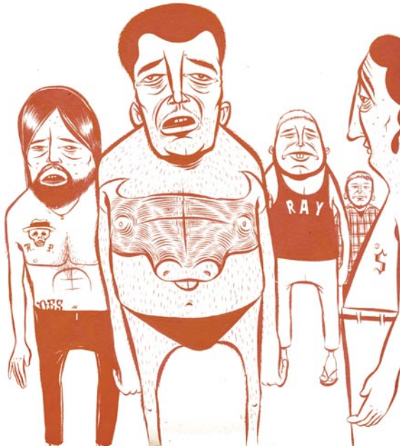
work by Barry McGee, from the exhibition "Beautiful Losers"